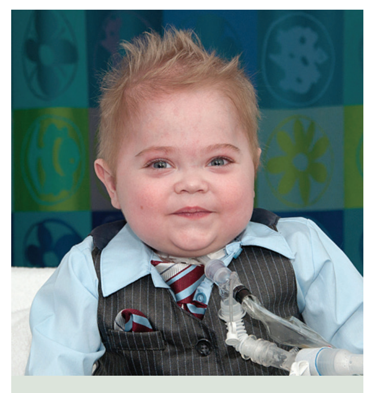
Simulated events through this program provide experiences in managing emergency situations that are common in children with tracheostomy tubes.